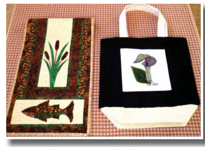
Quilted Table Runner and Embroidered Tote Bag by Karen Jung

Those are just a few of the things we know about at press time. There's room for your donations, too. A dozen flies, a rod from the closet, other angling gear, baked goods from the kitchen, books – they're all fine donations. Please drop your donation off at Bob Mitchell's Fly Shop in Lake Elmo in advance. You may make your donation on the night of the banquet, but please be prepared to create a bid sheet for it and to help put it on display.