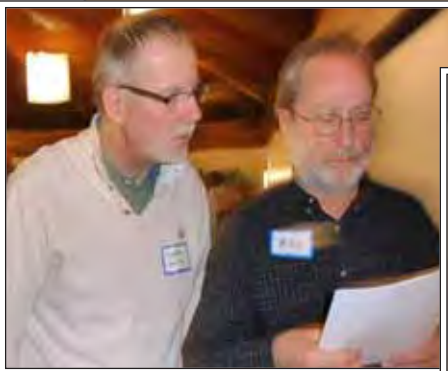
Some photos from last year's Holiday Banquet.

Tickets for this event are a mere $35. You may call Bob Mitchell's Fly Shop (651/770-5854) or Jonathan Jacobs (715/386-7822) to make your reservation and all tickets are payable at the door. The reservation deadline is 4:00 PM on Monday, November 29th. Please call; showing up without a reservation will cost you $50. Tartan Park is located at 11455 20th St. North in Lake Elmo MN.