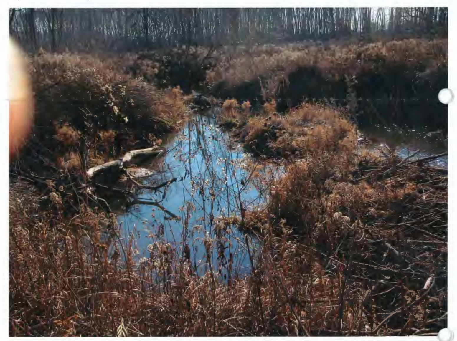
THIS IS A PHOTO OF THE TRIMBELLE, BELOW HIGHWAY W, IN NOVEMBER.