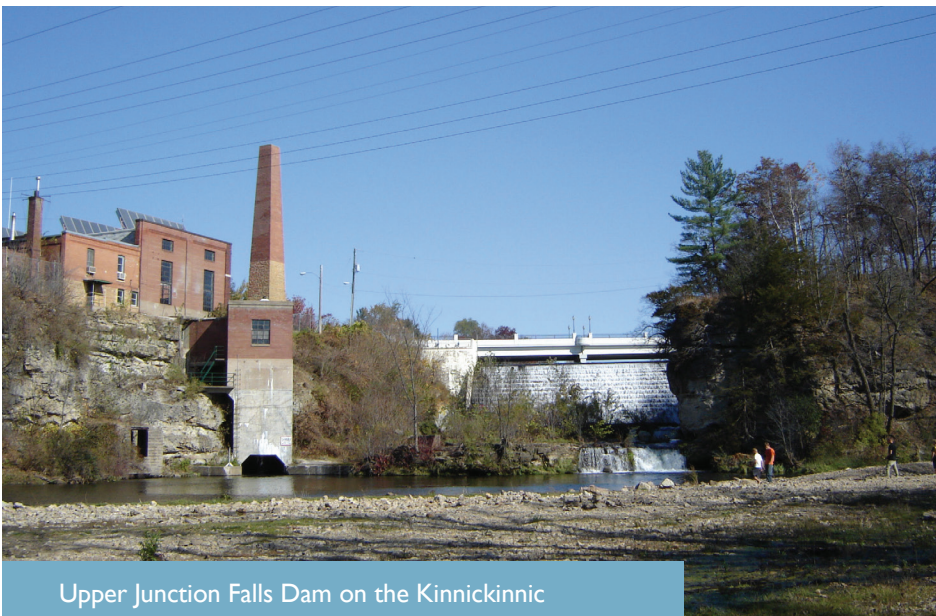
Upper Junction Falls Dam on the Kinnickinnic