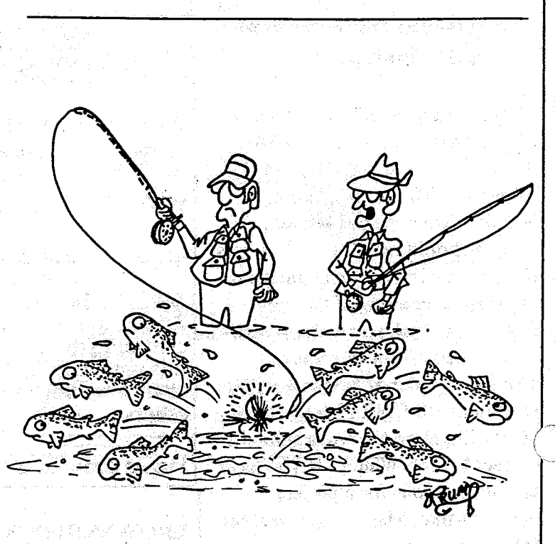
"Think I'd try a different fly..."

The rest of the day turned out almost as well as I had hoped. The little stumble gave me a chance to consider the advantages of going out with a partner or telling someone where you are going.