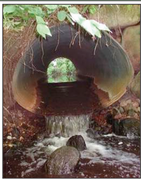
LEFT- PERCHED CULVERTS CAN PREVENT MOVEMENT OF FISH, INSECTS, AND OTHER AQUATIC LIFE