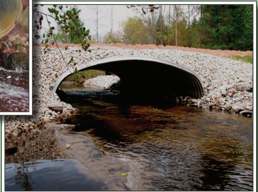
RIGHT- SOME CULVERTS ALLOW EXCELLENT PASSAGE