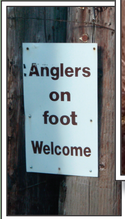
BELOW- ACCESS GRANTED

In order to carry out the mission, our chapter must work with various partners such as the Wisconsin DNR; the Kinnickinnic River Land Trust; townships, cities, and counties; and the various sportsmen's clubs within our area. We must leverage our available funds to achieve maximum impact. We must advocate for appropriate legislation at the state and national levels. As Red Green says, "We're all in this together."