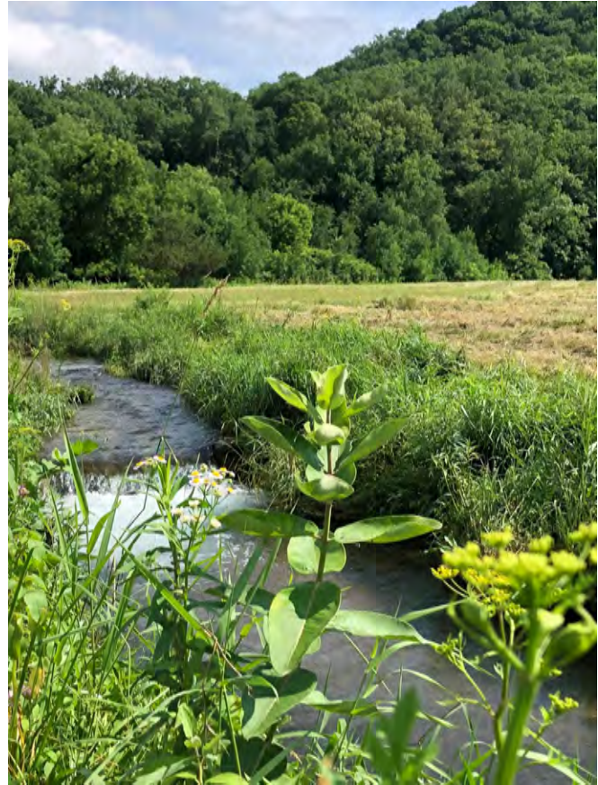
Fig. 1. Pine Creek, Pierce County, Wisconsin.

Each year, private entities, county, state, and federal governments, and non-governmental organizations like Trout Unlimited spend millions of dollars on stream restoration projects in the Driftless Area (Fig. 2), for the primary purpose of improving the Driftless Area's coldwater streams for Brook Trout Salvelinus fontinalis , Brown Trout Salmo trutta , and