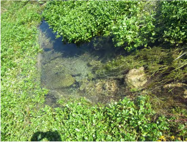
Fig. 12. Estimating the presence of macrophytes at a stream restoration monitoring site.

Role of Volunteer Monitoring and Citizen Science. While agencies, colleges/universities, and consultants may very capably implement more complex monitoring protocols, their resources are often limited. As such, volunteers and non-governmental organizations (NGOs) can play a key role to support stream restoration monitoring. State and local volunteer monitoring and citizen science programs are good examples of the application of simplified monitoring protocols that allow consistent comparisons of ecologically-relevant metrics. A rich history of volunteer monitoring exists in Wisconsin, including Water Action Volunteers (WAV) and the Citizen-Based Monitoring Partnership Program (CBMPP). The Minnesota Pollution Control Agency's (MPCA) Citizen Stream-Monitoring Program (CSMP) began in 1998, with the goal of giving individuals across Minnesota an opportunity for involvement in a simple, yet meaningful stream monitoring program. Volunteer water monitoring has been a component of the Iowa Department of Natural Resources (IDNR) since 1998, via IOWATER. In 2017, however, IDNR launched a new, locally-led volunteer water monitoring program to help Iowans better understand their local water quality.