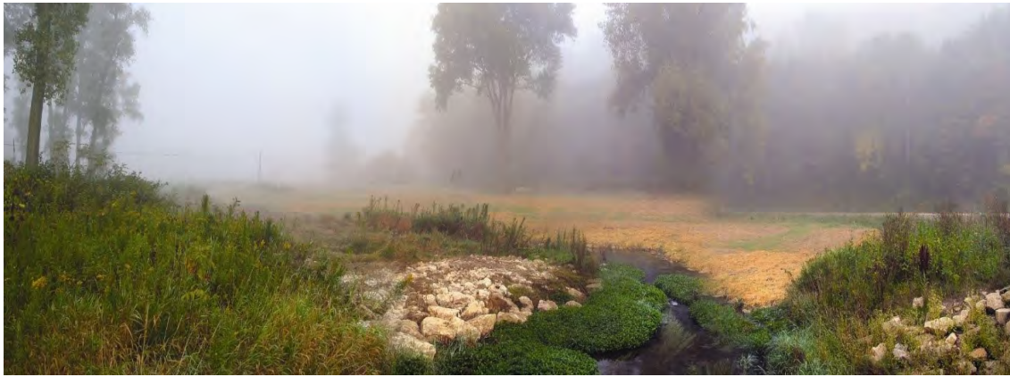
Fig. 2. A restored trout stream reach at Pine Creek, in Pierce County, Wisconsin.