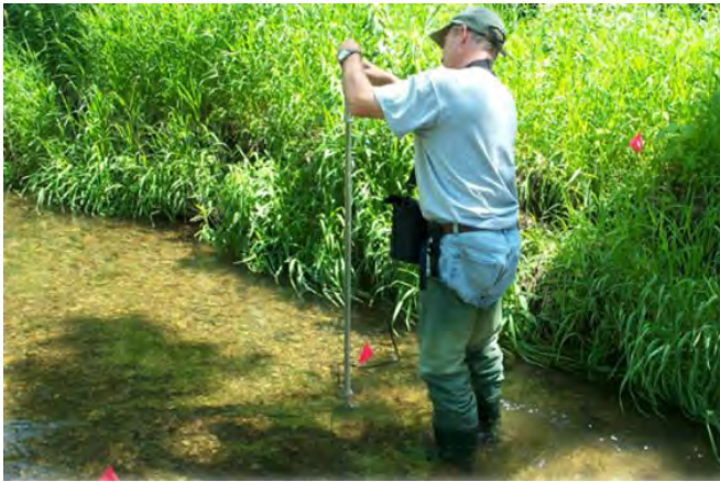
Fig. 6. Measuring flow velocity at a stream restoration monitoring site.

While it is crucial that selection of elements and methods be guided by specific restoration project objectives, additional factors such as the level of expertise and resources available must also be considered during monitoring plan development (25, 26). Consideration should be given to monitoring methods that can not only be implemented on a project-specific basis, but can also be learned through guidance documents and basic field training. This is a particularly important consideration if volunteers and/or citizens will be engaged in the monitoring work.