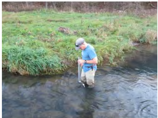
Fig. 10. Collecting a water sample (top) and measuring water clarity (bottom) at a stream restoration monitoring site.

and runoff conditions within the restoration reach can provide valuable information on levels of nutrients available for stream eutrophication, sediment levels degrading fish and invertebrate habitat, and pathogen levels that may be impacting public use (Fig. 10). Water chemistry information can also be used to evaluate groundwater age and source, as well as watershed land use impacts that need broader attention.