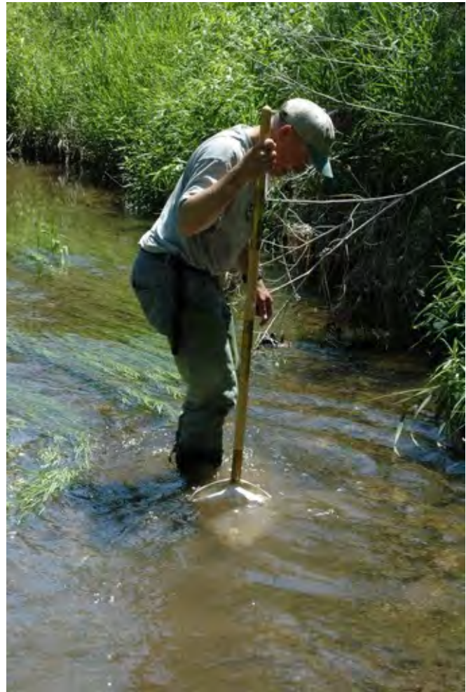
Fig. 11. Using a kick-sampling protocol to collect a macroinvertebrate sample at a stream restoration monitoring site.

Monitoring Riparian Area Elements. The riparian areas created by stream restoration projects provide multiple benefits, including flood control and storage, water quality improvement via sediment and nutrient processing, groundwater recharge, carbon sequestration, and critical habitat for mammals, birds, reptiles, amphibians, and pollinators. Improved riparian area management can also provide stream resilience to climate change (via shading and groundwater infiltration, for instance). Depending on project objectives, many opportunities exist for monitoring the benefits created by riparian area restoration. Hastings (59) provides guidance on incorporating nongame wildlife habitat into stream restoration projects (see Hastings and Hay, this volume). This guidance includes recommended pre- and post-restoration monitoring protocols that can be used to determine if the nongame habitat features accomplish