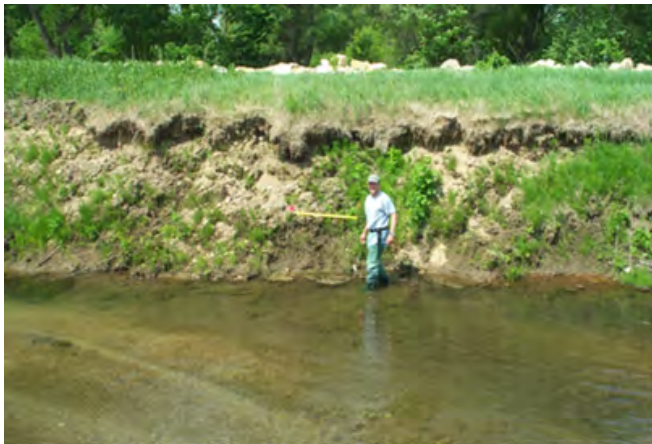
Fig. 3. A degraded Driftless Area stream, with a wide, shallow channel, slow current velocity, and eroded bank.