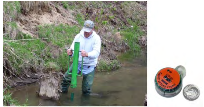
Fig. 7. Deploying a logger (right) for continuous measurement of water temperature at a stream restoration monitoring site.

Water temperature is a critical factor influencing the biological activity and species composition in coldwater streams of the Driftless Area. Temperature also has an important influence on pH, density, specific conductance, the rate of chemical reactions, and solubility of constituents in water. Methods for continuous monitoring of stream temperature have been documented by the USGS (29), U.S. Forest Service (30) and the WDNR (31). Trout Unlimited has also published several protocol documents (32, 33) that are oriented toward volunteer engagement in continuous stream temperature monitoring (Fig. 7).