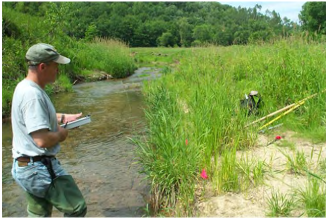
Fig. 9. Evaluating geomorphic conditions at a stream restoration monitoring site.

information on how the restoration project withstands any climate-influenced impacts related to increasing temperature, precipitation, and runoff. Hastings, et al. (33) provides protocols for measuring four key geomorphic variables that have the greatest impact on stream temperature: stream width, water depth, water velocity, and canopy cover. Changes in these four variables from pre- to post-restoration may best explain any temperature improvement observed as a result of the restoration project. Other geomorphic (habitat) variables can also be measured as resources allow. These variables include: stream channel bankfull width and depth, stream bank height, depth, slope, and soil type, and stream bed substrate composition. Procedures for evaluating habitat characteristics in four key stream zones (stream bed, water column, stream banks, and flood plain) and an extensive glossary of terms related to habitat characteristics are provided by Simonson, et al. (35). The Minnesota Pollution Control Agency (MPCA) has also documented protocols for assessing physical habitat in wadeable streams (36, 37).