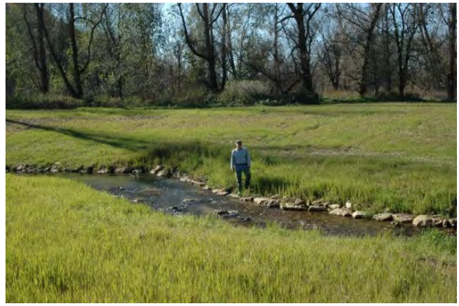
Fig. 4. A restored Driftless Area stream (same location as Fig. 3), with a narrow, deep channel, rapid current velocity, and sloped bank.

Rainbow Trout Oncorhynchus mykiss . Past fisheries surveys have demonstrated that stream restoration projects improve trout numbers and often allow streams to sustain populations of wild trout via natural reproduction. Hunt (3) and Avery (4) have summarized evaluations of 103 trout stream habitat improvement projects conducted by the Wisconsin Department of Natural Resources (WDNR) during the 1953-2000 period. Restoration project outcomes were generally favorable, producing increases in total trout abundance, size, and biomass. Due to stream restoration efforts, the WDNR has upgraded the classification status of many miles of coldwater streams during the past several years.