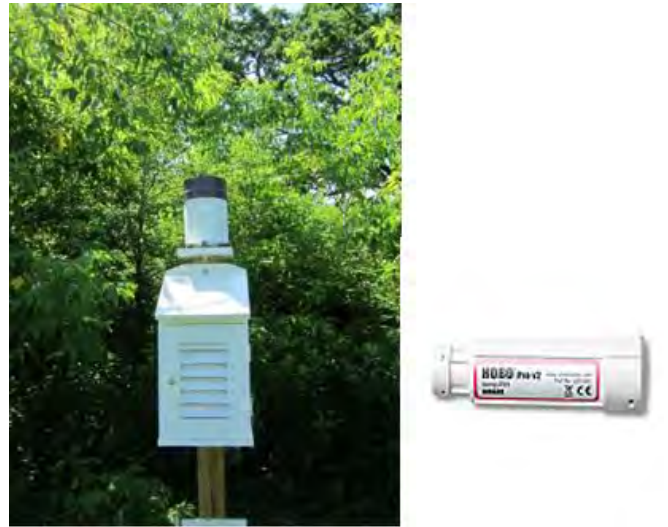
Fig. 8. A weather station with instrumentation for continuous monitoring of air temperature, relative humidity, dew point (right), and rainfall.

Air temperature is the climate variable that best explains spatial and temporal variation in stream temperature (6). Because of the impact of air temperature on water temperature, it is important to monitor air temperature in the locale where stream temperature monitoring sites have been established. Hastings, et al. (33) provides protocols for continuous monitoring of air temperature, dew point, and relative humidity, as well as the collection of rainfall data (Fig. 8).