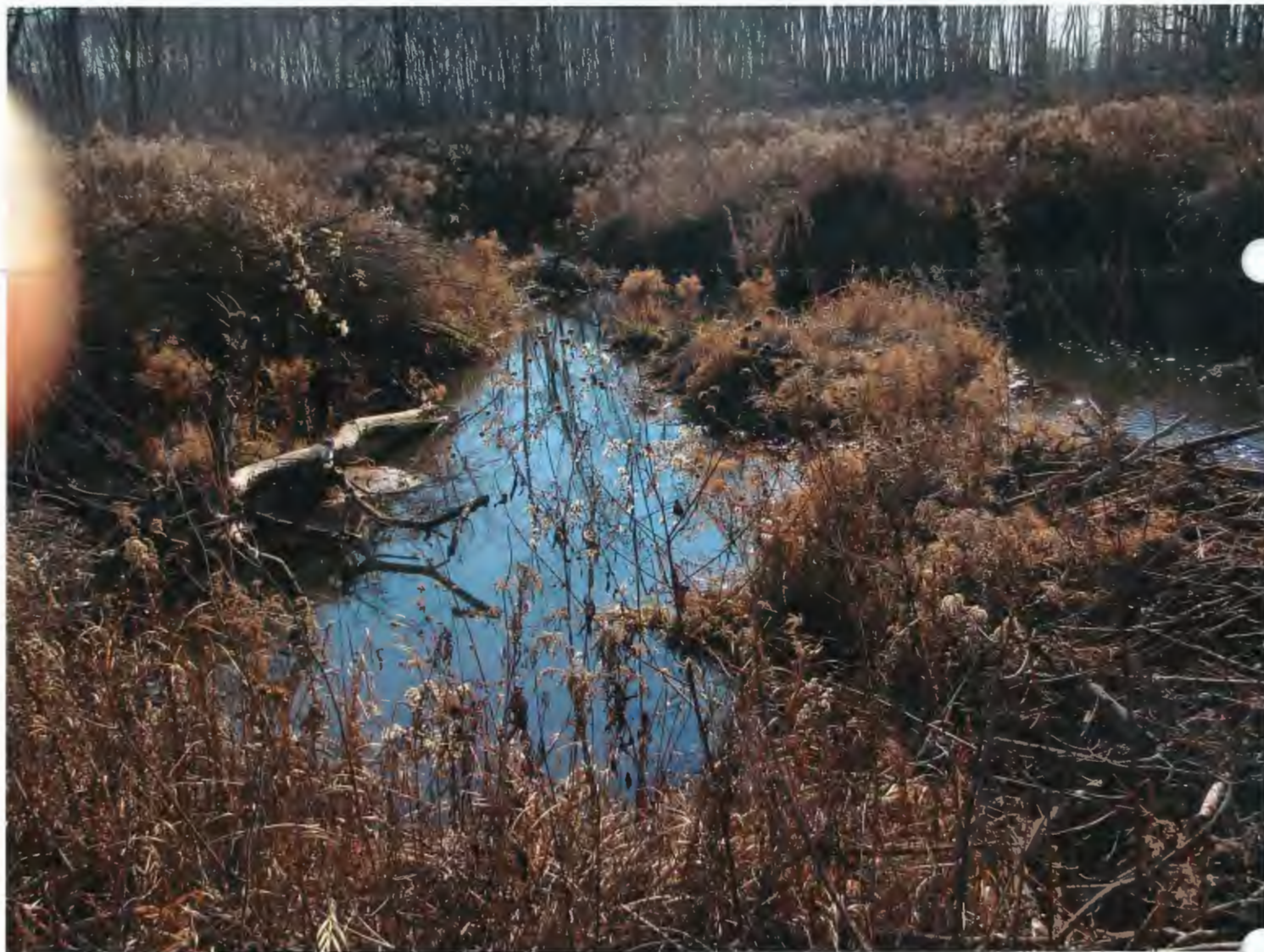
THIS IS A PHOTO OF THE TRIMBELLE, BELOW HIGHWAY W, IN NOVEMBER.