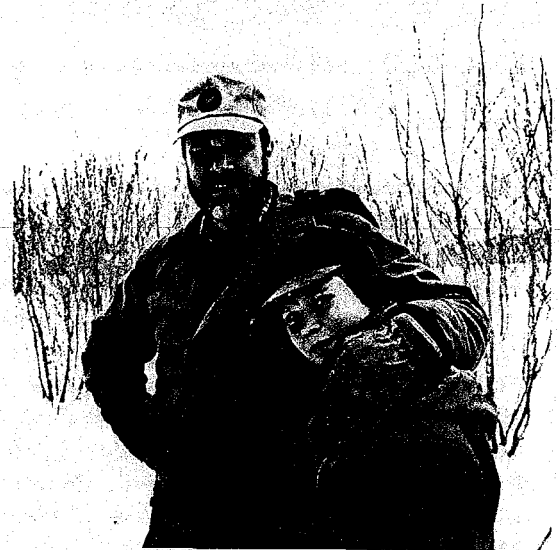
Father and son...Teamwork on the Kinni