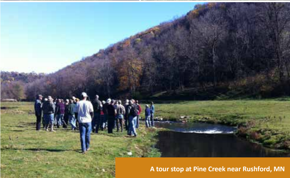
A tour stop at Pine Creek near Rushford, MN